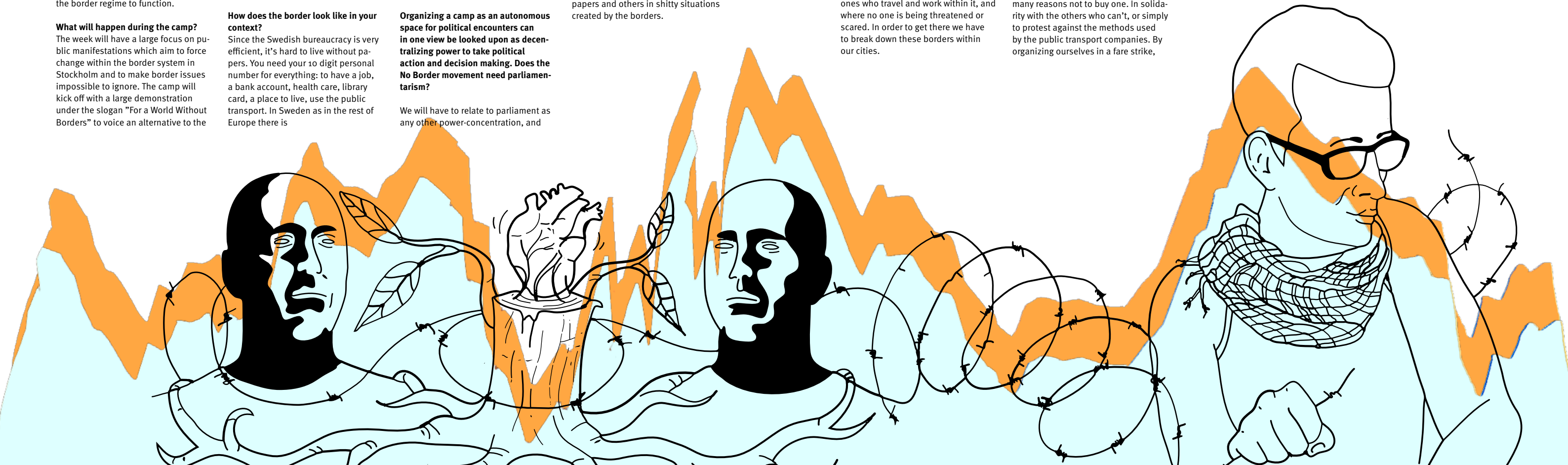
Illustration: Emanuel Löwstedt

we are not only able to put pressure on decision makers to change the unfair pricing system, it is also very much an act of solidarity. Solidarity among commuters and workers regardless nationality and origin. Planka.nu has been cooperating with No One Is Illegal Sweden for several years, we are contributing with ticket money for those who really can't afford to get caught fare dodging.